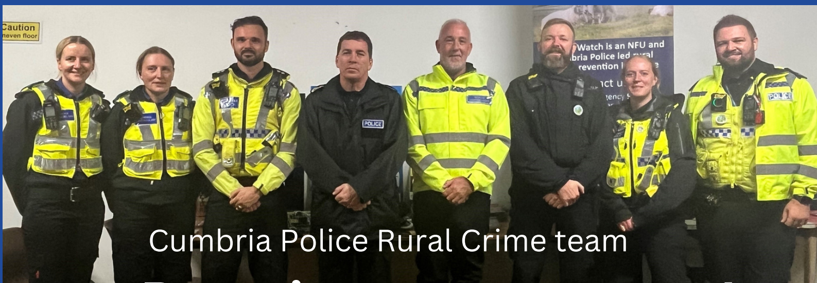
Cumbria Police Rural Crime team

Cumbria Police Rural Crime Team was launched recently during a National Rural Crime Week 18 to 24 September. The Rural Crime Police Team have a dedicated Facebook page here - https://www.facebook.com/cumbriapoliceruralcrimeteam where the team will highlight issues, incidents, and advice on how our communities can keep themselves safe.