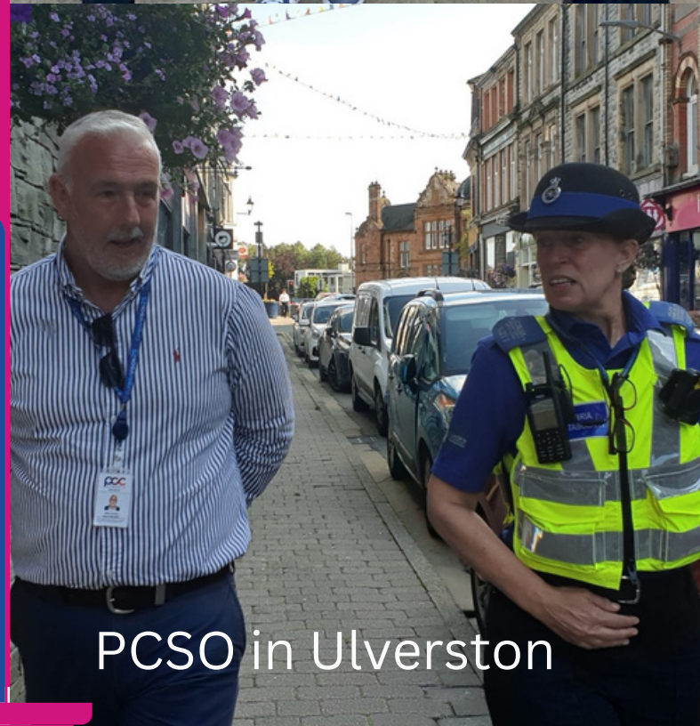
PCSO in Ulverston