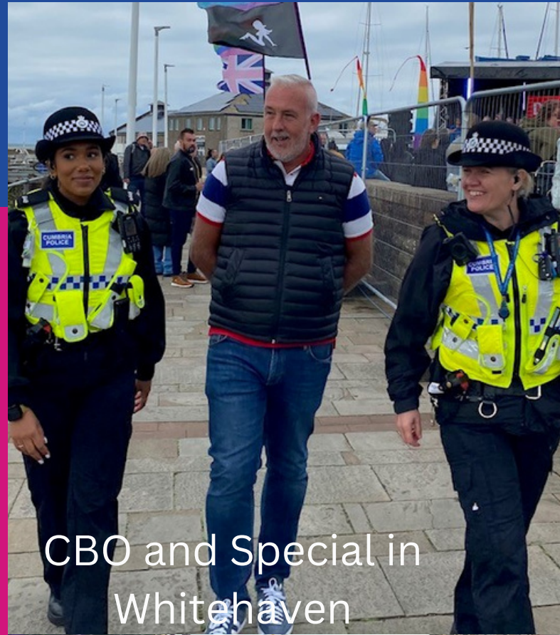
CBO and Special in Whitehaven