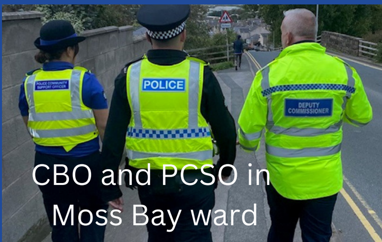
CBO and PCSO in Moss Bay ward